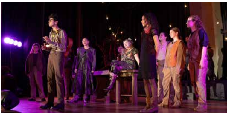
Hadestown: Teen Edition at West Scranton Intermediate School.

Youth Arts Coalition put on a production of Hadestown: Teen Edition at West Scranton Intermediate School in the fall of 2025.