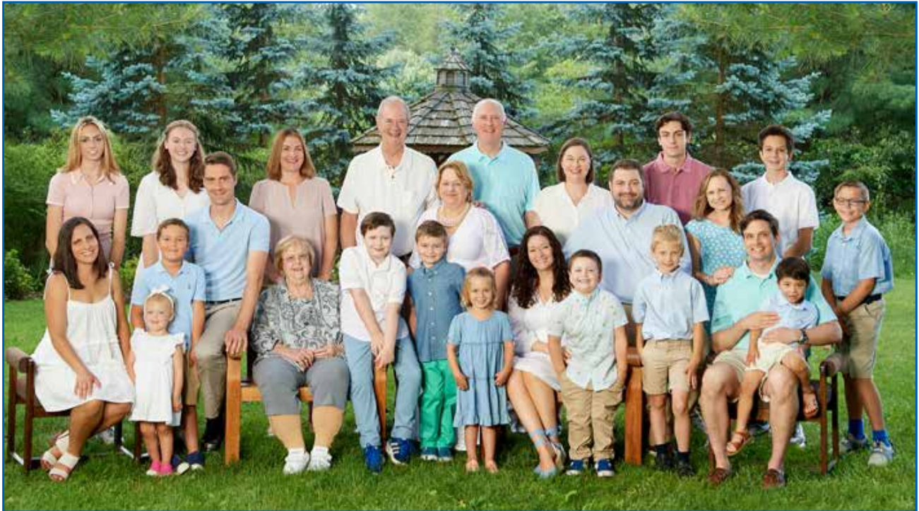
Four Generations of The Hawk Family