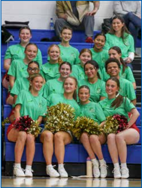
Shirts with uplifting messages are worn at local school events.

NEPA Youth Shelter invested in a new space for their after-school Teen Drop-In Center. Shown here is the cutting of the ribbon on the center's opening day.