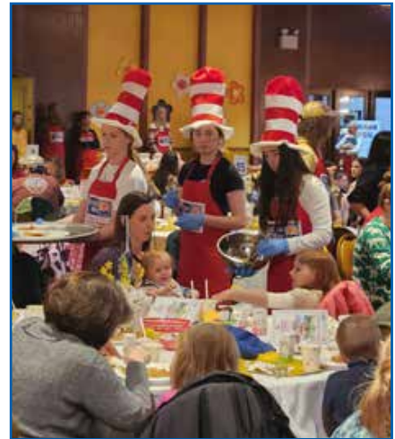
The Storybook Breakfast event to support The Dolly Parton Imagination Library.