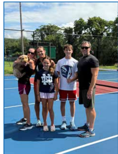
New pickle ball court at St. Anthony's Memorial Park in Dunmore