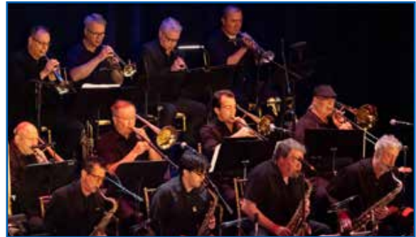
The Scranton Jazz Festival performance at The Scranton Cultural Center.

St. Anthony's Memorial Park Association built a pickle ball court. One of the fastest-growing sports can now be enjoyed in the Dunmore community.