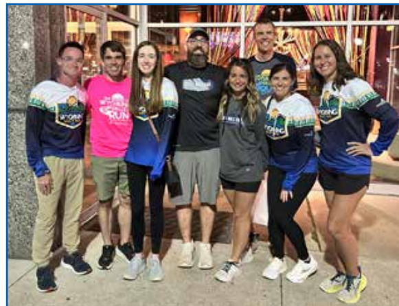
Organizers from the Wyoming Valley Run

Agape Academy for Autism Association of Fundraising Professionals Boys and Girls Club of NEPA Brighter Financial Futures Day Nursery Association Diocese of Scranton Catholic Schools Friendship House Geisinger Health Foundation Lacawac Sanctuary Foundation Lackawanna Historical Society Marywood University NativityMiguel School of Scranton Penn State Scranton Scranton Area Community Foundation Scranton Preparatory School The Rosen Method The University of Scranton United Way of Lackawanna, Wayne and Pike Counties